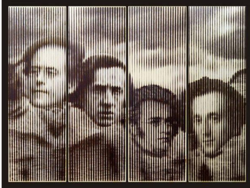
Sense the day - 2011, oil on canvas 200cm x 150cm

It is difficult not to react on current events or impressions. I hear the news (mostly I try to avoid them to a degree), I see a scene in a film, I get impressions seeing people living their life. Mostly the impressions go through a highly positive filter, so the result shows the unreal beauty of the artistic held moment.