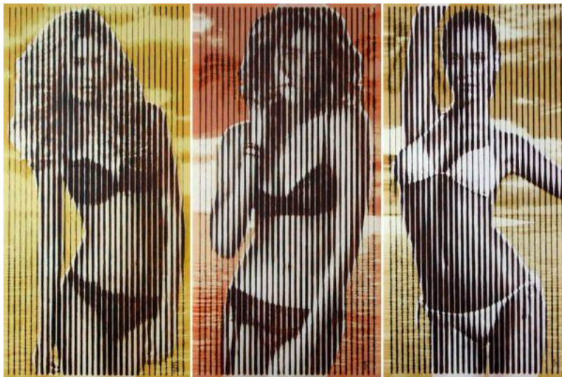
Indian Summer – 2010, oil on canvas 120cm x 80cm

Besides that there is no place left, I definitely would hang a painting of the medieval fantasy painter Hieronymus Bosch (1450 – 1516). The paintings show so much color and details, and his style was very futuristic for his time.