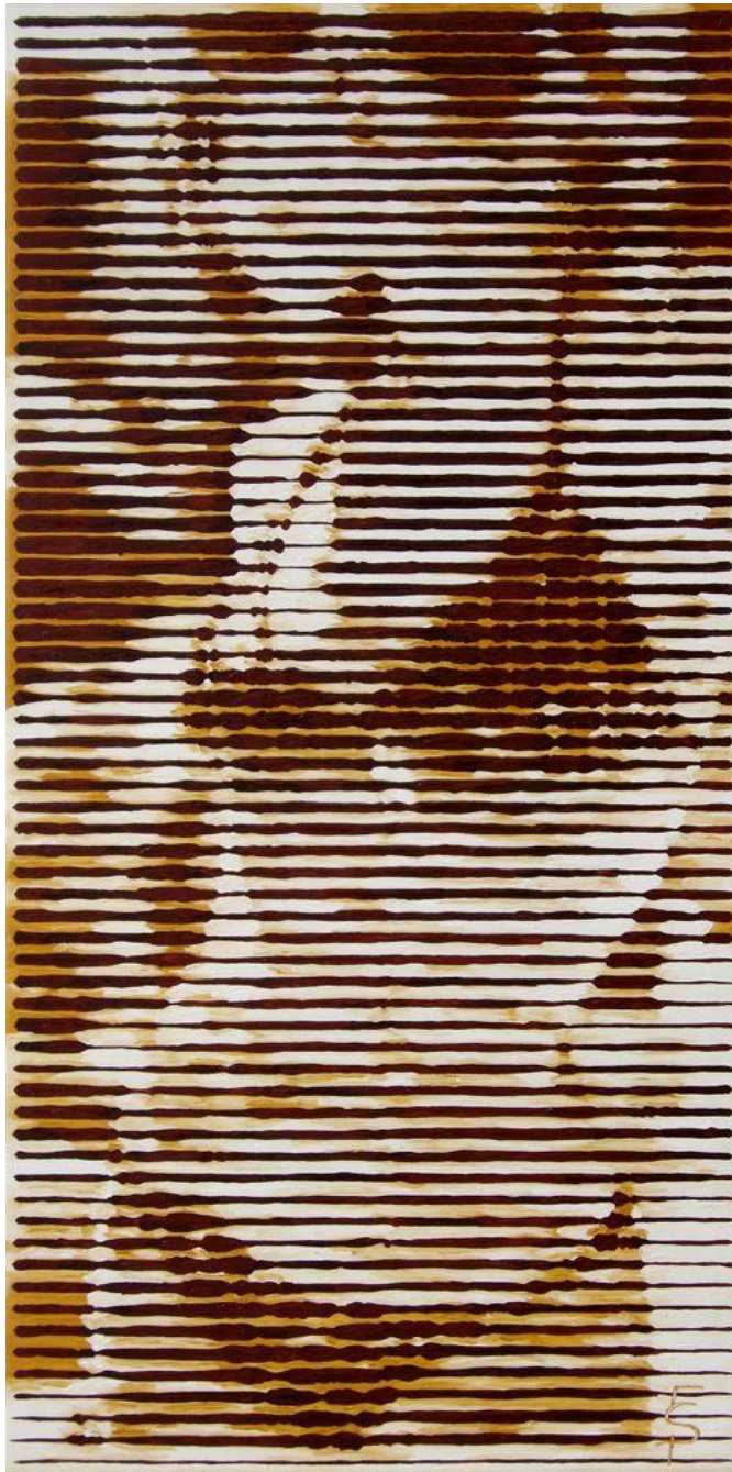
Hot - 2007, oil on canvas 40cm x 80cm